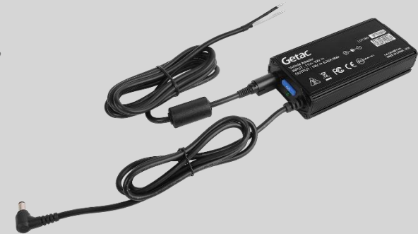
Bare Wire Version