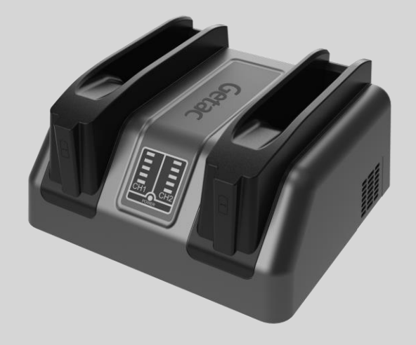
GCMC*J (Two Main Batteries)