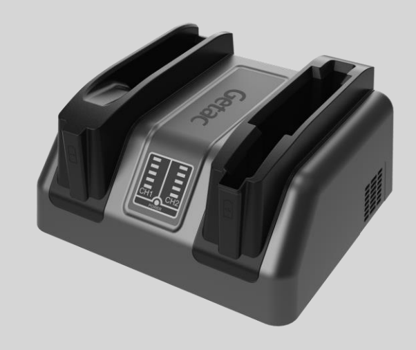
GCMC*K (Main Battery + Multimedia Bay Battery)