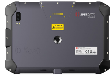
backside of the SD100