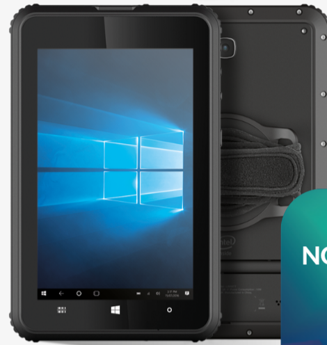
NQquire 800 II / II Plus tablets